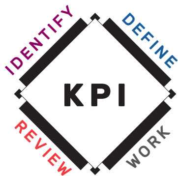
Figure 5 | Process of setting KPIS.

Source (Weaver, J. "What is a KPI Report & How do I create one?" KPI, November 7, 2018, https://www.clearpointstrategy.com/what-is-a-kpi-report-how-do-i-create-one . 2015.)