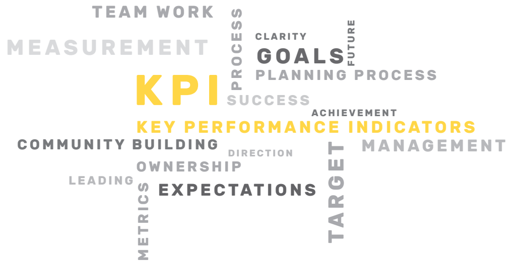
Figure 1 | Key Performance Indicators KPIs.

KPIs offer the opportunity for Indigenous communities to be the guardians of any planning process they are working on, as they can track, evaluate and change any aspect of the planning process. By setting clear KPIs, your community will be able to identify problems or delays in any particular aspect of the planning process 1 .